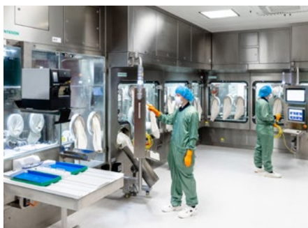
Mid & Large-Scale Filling