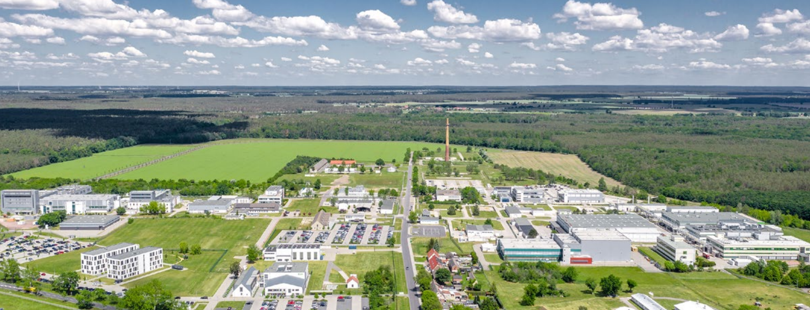
Headquarter in Dessau-Rosslau, Germany